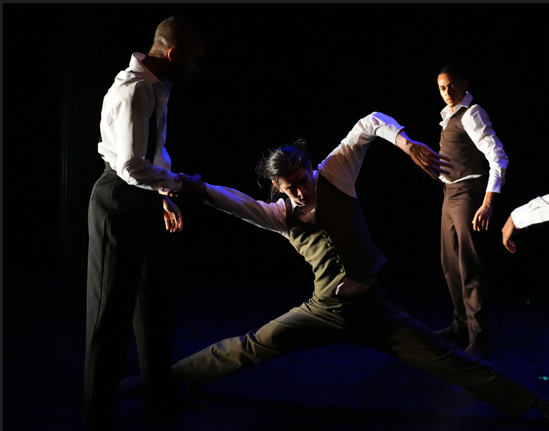
Still from "The Untold"