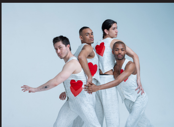
Stills from "Four Of Hearts"